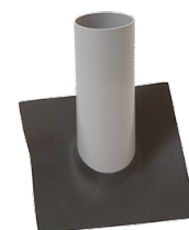
ROFLEX Sealing grommet made of strong and highly flexible EPDM for rapid and permanent airtight feedthroughs for pipes.

Continue to the next page for the Adhesion Matrix and further recommendations.