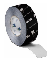
TESCOX EXTORA® Pressure sensitive adhesive tape for overlaps and end laps in SOLITEX EXTASANA® system.

https://proclima.com.au/solitex-extasana-adhero/ https://proclima.co.nz/solitex-extasana-adhero/