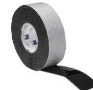
TESCOX® NAIDECK Is double-sided self-sealing strip, design to seal penetrations of purlins, battens or studs.