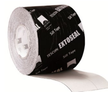
TESCOX EXTOSEAL® Flexible flashing tape for use around window and door openings as part of the SOLITEX EXTASANA® system.